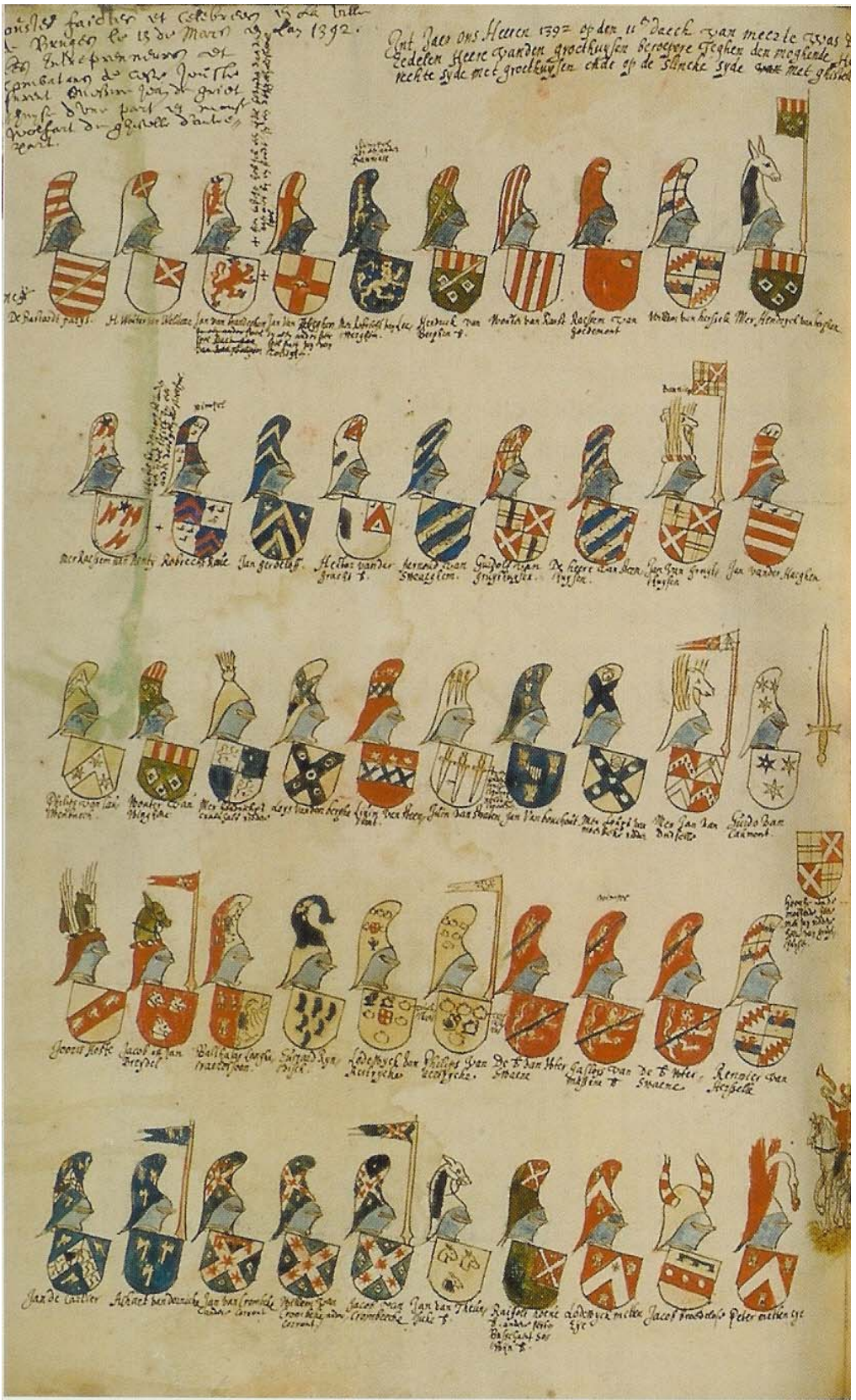
TBG/g: the Gruuthuis party